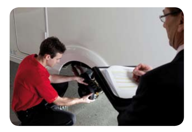
There are hundreds of mobile and fixed Approved Workshops throughout the UK.

The Approved Workshop will normally guarantee their work for a minimum of six months and take all reasonable steps to protect the validity of any unexpired warranties.