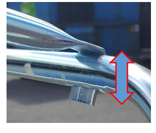
Ensure the tabs pass through the tube fully!